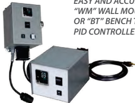
EASY AND ACCURATE "WM" WALL MOUNT OR "BT" BENCH TOP PID CONTROLLERS