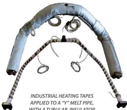
INDUSTRIAL HEATING TAPES APPLIED TO A "Y" MELT PIPE, WITH A TUBULAR INSULATOR INSTALLED OVER TOP.

Rugged and Flexible... Industrial Duo-Tapes® are ideal to wrap onto tubular shapes such as melt pipes, tanks and vessels and hoses. A fast solution for process surface heating, Industrial Duo-Tapes® may be quickly procured and easily installed.