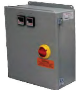
MULTI-CIRCUIT CONTROL PANELS CAN OFFER HIGHER AMP SOLUTIONS