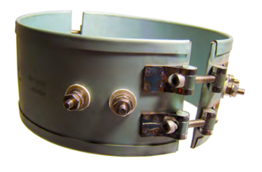
CERAMIC BAND HEATERS