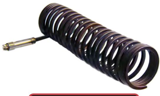
MICA BAND HEATERS