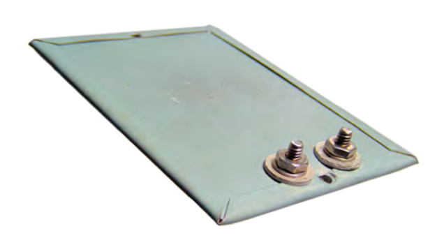
CERAMIC STRIP HEATERS