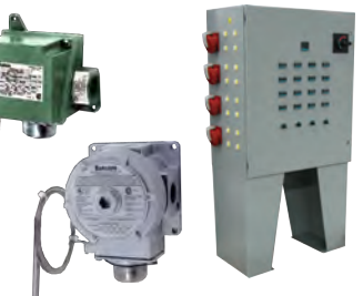
Custom Control Panels: Control Systems may be Wall, Floor, Rack or Portable Cart mount type. Contact support at HTS/Amptek<sup>®</sup> for expert design consultation.