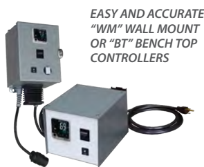
EASY AND ACCURATE "WM" WALL MOUNT OR "BT" BENCH TOP CONTROLLERS