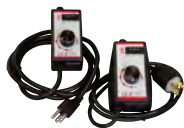
LOW COST LCZ ADJUSTABLE RHEOSTAT TYPE SWITCHES