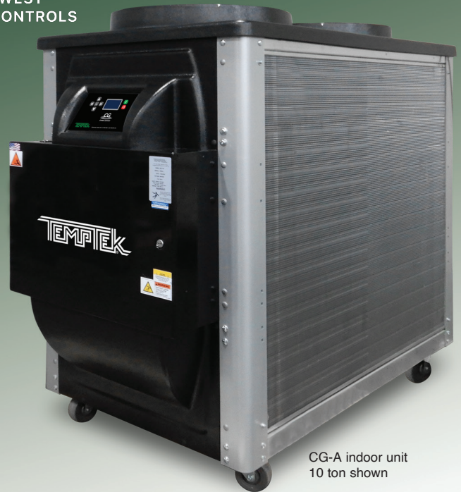
CG-A indoor unit 10 ton shown