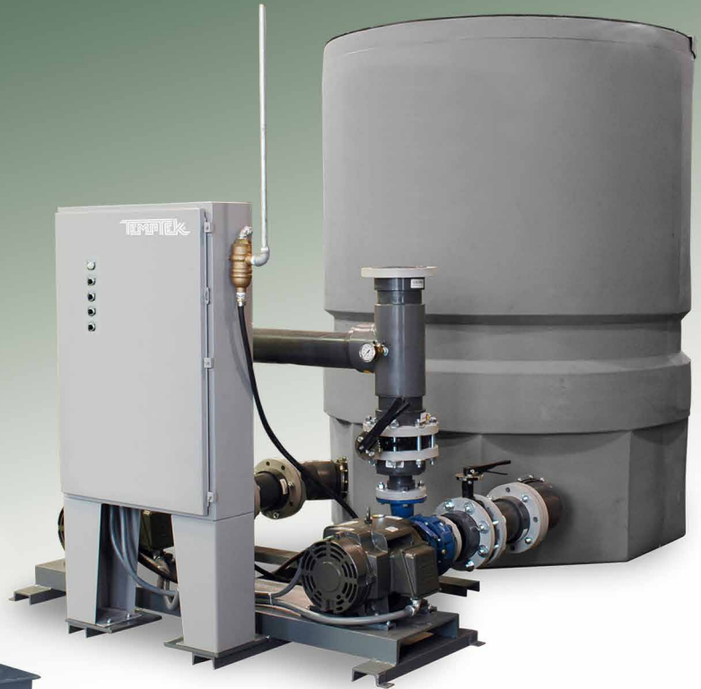
PPT-1500-2P shown with these optional features: • Central control console • Electric water make-up system