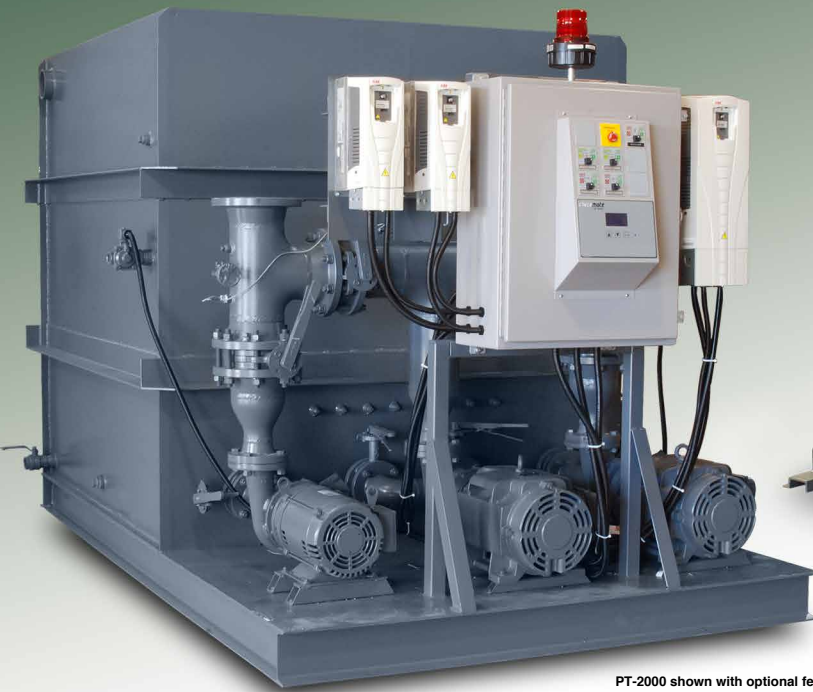
PT-2000 shown with optional features: • Standby pump and manifold • Central control console • Pressure and temperature alarm system • Electric water make-up system • Variable Speed Drives